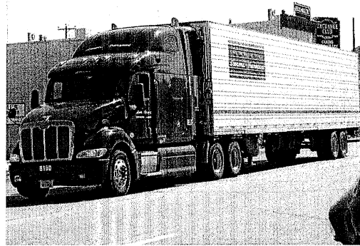
Body of a transport trailer