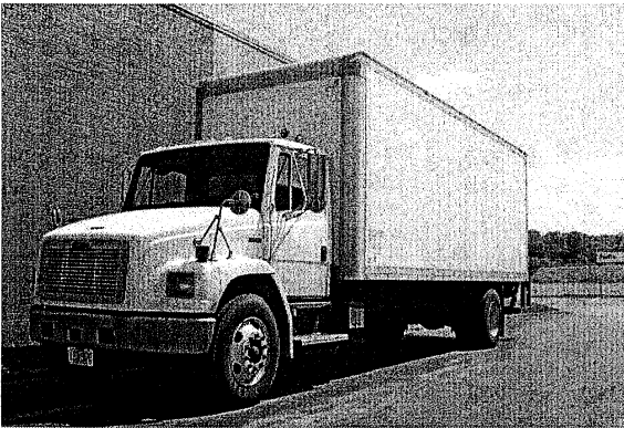
Body of a straight truck