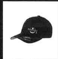
Flexfit Adult Wooly 6-Panel Cap