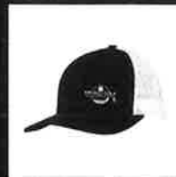
Snapback Trucker Cap