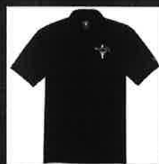
Ogio Caliber 2.0 Polo Og101