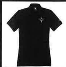
Ogio Jewel Polo